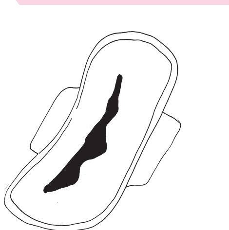
blood on pad