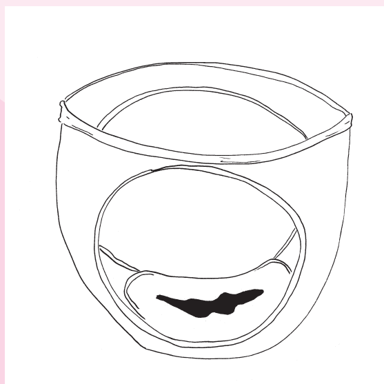
blood on pants